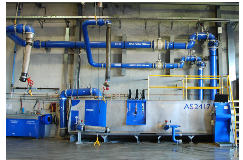
Our Certified AS2417 Test Rig