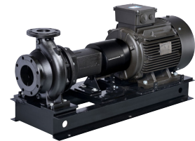
End Suction Pumps